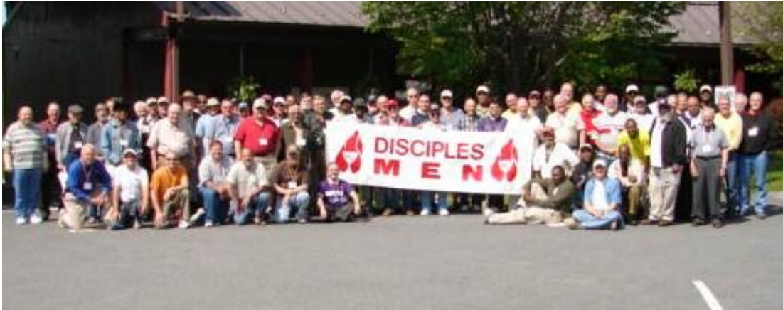
Pictured above: Disciples Men Spring Gathering with Virginia Regional Men!